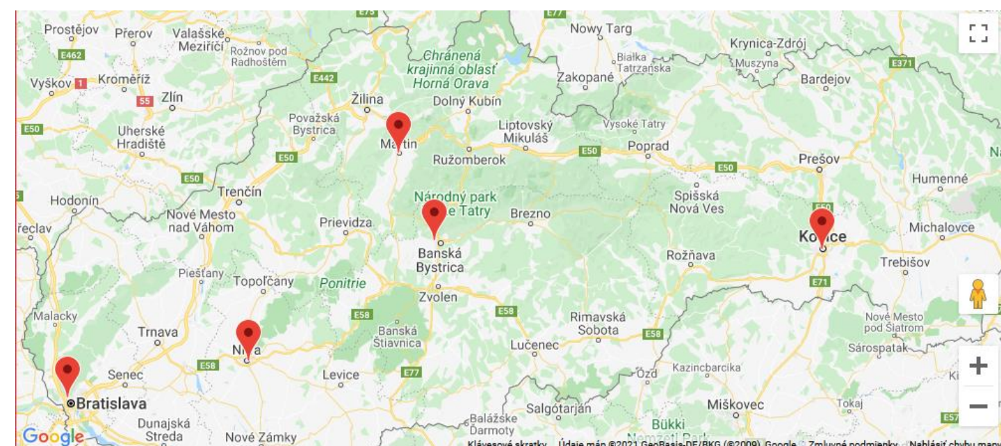
Five centers for HIV positive patients in Slovakia